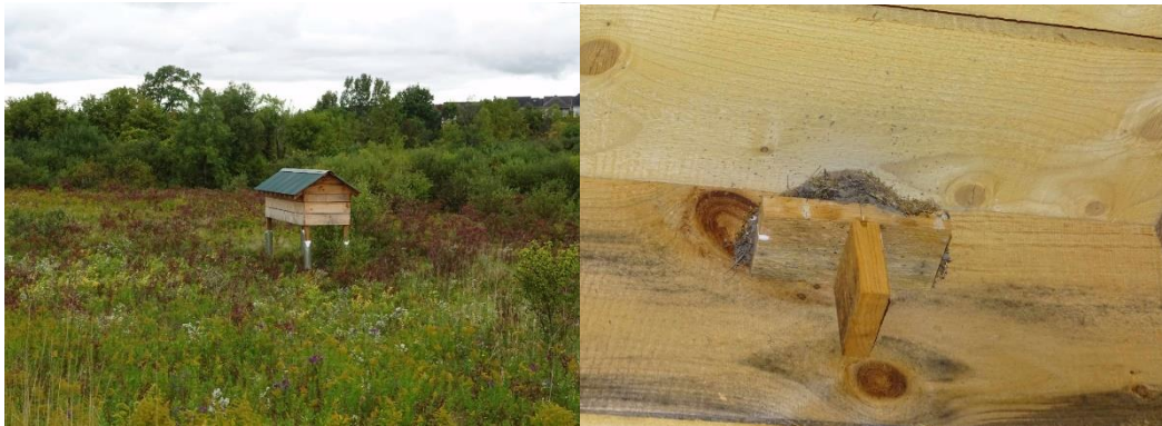
A nesting structure was built for the provincially threatened Barn Swallow, left, with evidence of its success on one of its nesting ledges inside, right.