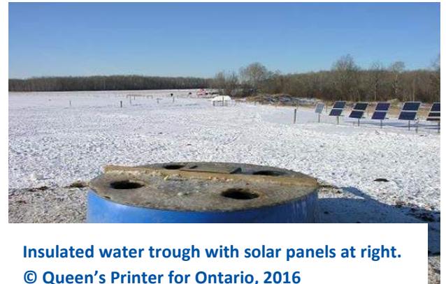
Insulated water trough with solar panels at right.