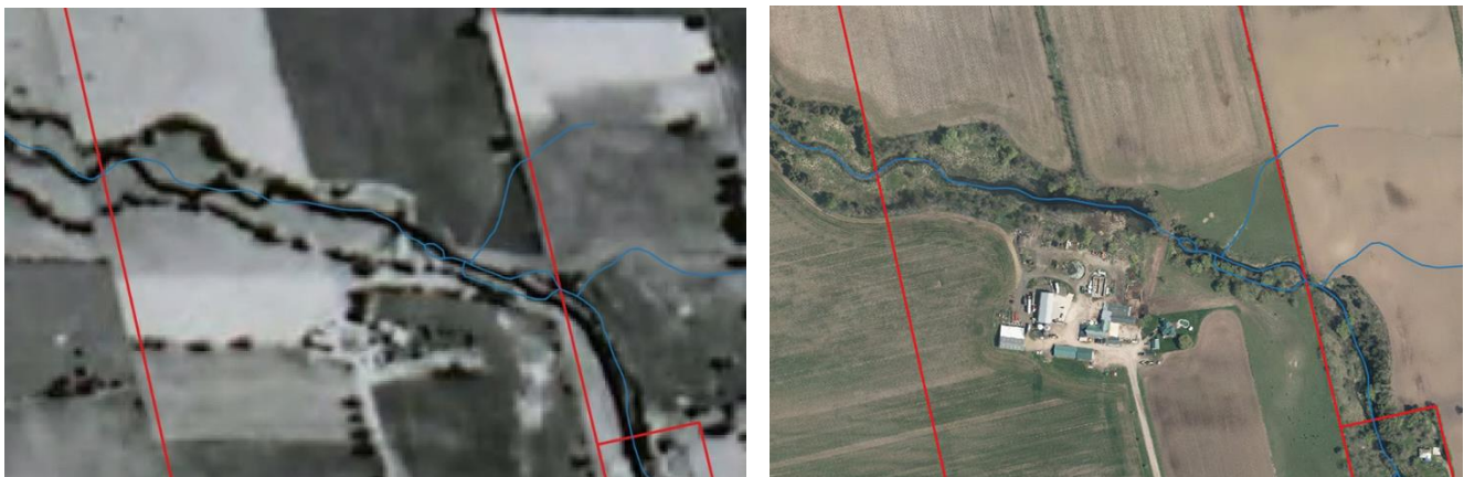
This site (captured on air photo in 1954 at left) with assistance from the HWSP, restricted livestock access to the tributary in 1995, creating a well-established riparian buffer (photo at right, 2019).

NOTE: Although the Hamilton Conservation Authority (HCA) and the Hamilton Watershed Stewardship Program (HWSP) may provide technical information and recommendations, it is the responsibility of the applicant to ensure that the practices and structures undertaken are suitable to the applicant's operation, and technically and structurally adequate. Neither the members of the HCA, the HWSP or the Project Technical Advisory Committee (PTAC) are liable for any loss arising from the use of any advice or information provided as part of or under this program.