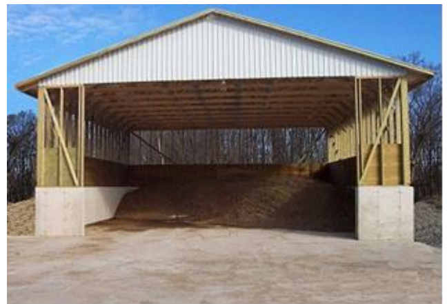
A covered manure storage eliminates runoff.