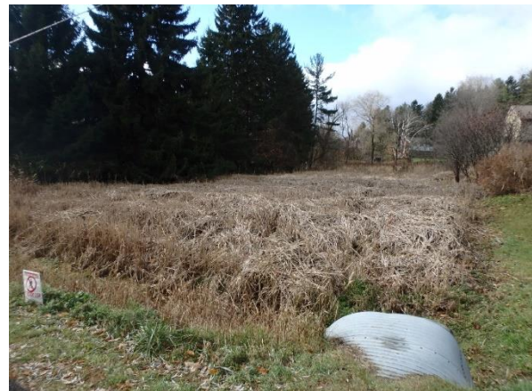
A stand of Phragmites australis (Common Reed), pre and post treatment.