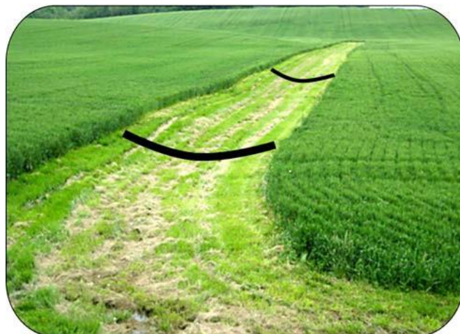
A well-designed grassed waterway allows water to flow without eroding the channel and importantly allows farm machinery to cross safely.