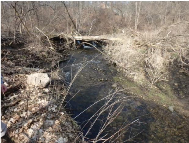
Work was completed to remove a significant debris jam in 2019 (left photo prior to work), restoring fish passage to the creek as well as improving overall stream hydrology (right photo taken in 2020, a year after work completed).