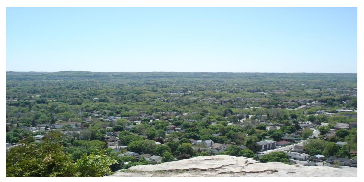
View from Dundas Peak

The escarpment is protected by the Niagara Escarpment Commission's (NEC) Niagara Escarpment Plan, and the Niagara Escarpment Planning and Development Act (NEPDA), however, further protection should be considered to protect areas outside these jurisdictions as developmental pressures increase. The Niagara Escarpment is an major component of the Dundas Valley'areas unique culture, charm and its protection, preservation and promotion are essential to the preservation and enhancement of the Dundas Valley area.