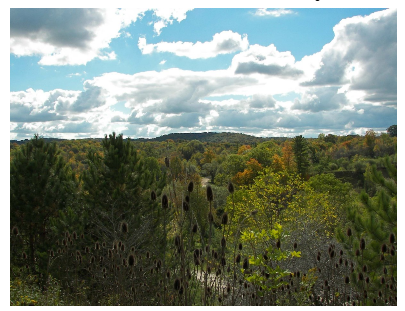
The Niagara Escarpment, Dundas Valley

The Niagara Escarpment is a geologically unique and important feature in Southern Ontario. Within the Dundas Valley 50-Year Vision and Strategy the escarpment encompasses a rich mosaic of forests, farms, recreational areas, scenic views, cliffs, streams, wetlands, rolling hills, waterfalls, mineral resources, wildlife habitats, historic sites, villages, towns, and cities.